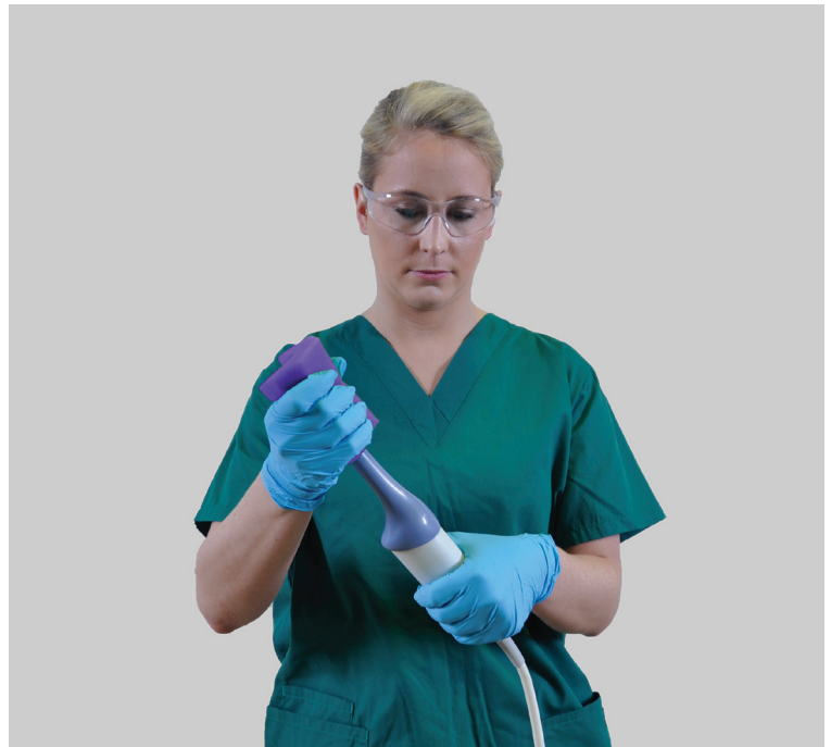
NUZyme™ Enzymatic Sponge being used to clean an ultrasound transducer prior to high-level disinfection

The American Institute for Ultrasound in Medicine (AIUM) recommends cleaning ultrasound transducers even if a probe cover or sheath is used: