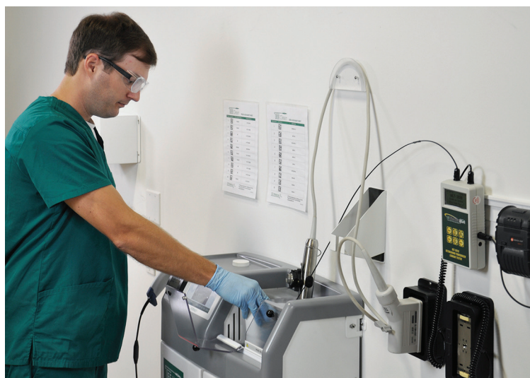
TEEClean Cleaner Disinfector shown with single-use high-level disinfectant

One final administrative issue with using test strips involves maintaining an adequate, on-hand supply, particularly when multiple manufacturers' products are used. Test strips are supplied in different quantities, depending on the particular disinfectant. The necessary Quality Control process cited earlier consumes six test strips alone (three for the positive and three for the negative controls) for both the Cidex OPA and the Metricide OPA, reducing the number of disinfection tests obtained from a single container of strips.