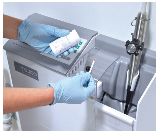
Test strip being used to confirm MRC of high-level disinfectant

One final administrative issue with using test strips involves maintaining an adequate, on-hand supply, particularly when multiple manufacturers' products are used. Test strips are supplied in different quantities, depending on the particular disinfectant. The necessary Quality Control process cited earlier consumes six test strips alone (three for the positive and three for the negative controls) for both the Cidex OPA and the Metricide OPA, reducing the number of disinfection tests obtained from a single container of strips.