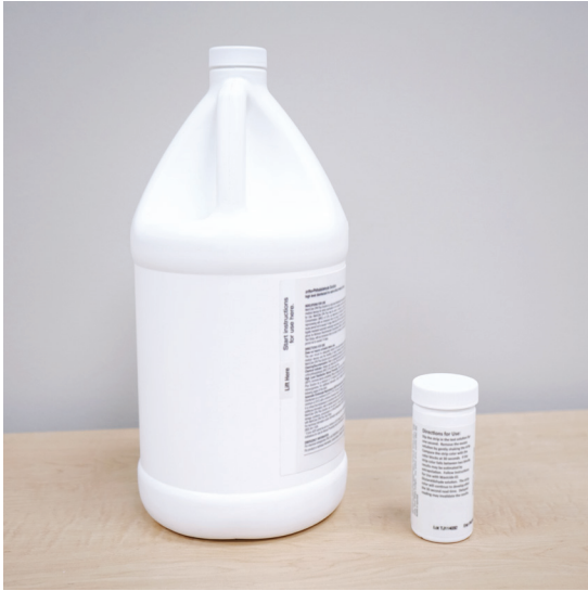
Reusable chemistry and test strips

The concerns about reusable disinfectant dilution and contamination are expressed in the "Guideline for Use of High-Level Disinfectants and Sterilants for Reprocessing Flexible Gastrointestinal Endoscopes". 2