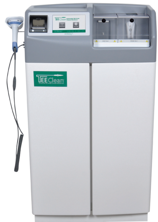
TEEClean Automated Cleaner Disinfecter — the first AUR with FDA 510k Clearance