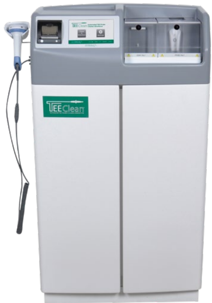
TEEClean® Automated TEE Probe Cleaner Disinfector

Infection Prevention and Control (IPC) Standard IC.02.02.01 states, "The organization reduces the risk of infections associated with medical equipment, devices, and supplies." As has been shown, automation is the best way to comply with that standard as it is the most effective way of reducing risk of all sorts. A study on the effectiveness of automation at the University Hospital Muenster in Germany found, "Automated disinfection had a statistically significantly higher success rate of 91.4% (106/116) compared with 78.8% (89/113) for manual disinfection (P = 0.009). The risk of contamination was increased by 2.9-fold when disinfection was performed manually." This means that when minimizing risk is the priority, automation must be the method of choice when reprocessing TEE ultrasound probes.