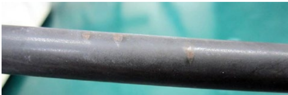
Biofilm formation due to improper cleaning technique

The FDA provides TEE ultrasound probe manufacturers with an extensive guidance document outlining the requirements for material compatibility. 27 For a manufacturer to attain FDA clearance, their probes must be rigorously tested for material compatibility and they must submit efficacy data, a record of how effective various HLDs and reprocessors are with their probe. It is critical for facilities to ensure that the TEE probe models they employ have been tested against the chemicals and reprocessors they will use to clean and high-level disinfect.