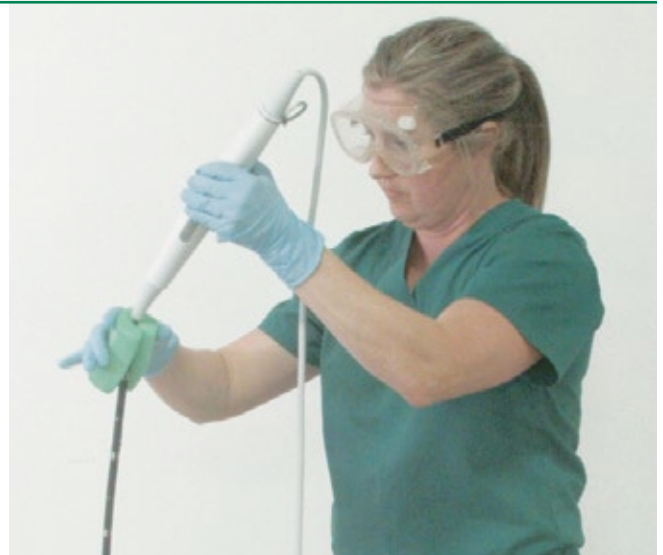
Enzymatic sponge applicator for pre-cleaning of soiled probe

CS Medical's TEEZyme Sponge, an enzymatic applicator, helps minimize the risk of the development of biofilm and helps ensure the success of the reprocessing procedure as a whole. TEEZyme Sponges are laden with a multi-tiered enzymatic detergent with a neutral pH, specifically formulated to remove gross contaminants and prepare the probe for the cleaning step. Once the probe has been wiped down with a TEEZyme Sponge, it can be covered with a PullUp Bio-Barrier Sleeve to keep it moist and safely transported to the reprocessing area in a TPorter. This simple solution protects expensive TEE probes, the facility's reputation, and patients.