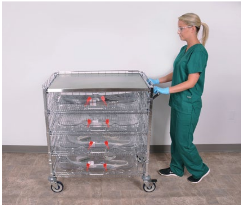
TransPorter™ mobile cart

One option is the TPorter TEE Probe Transportation and Procedure Case. The durable polycarbonate TPorter ensures that probes are not damaged during transportation to and from the procedure room. TPorter is a complete delivery system which has a compartment for everything needed for a TEE procedure and all the labels required to mark a clean or dirty probe. Facilities have reported a reduction of repair costs after introducing the TPorter. For example, according to Duke University Medical Center, mechanical failures have been reduced greater than 50% since utilizing the TPorter system. Implementing a TPorter into a facility's standard TEE procedure can reduce risk to the probe, the facility, and patient health.