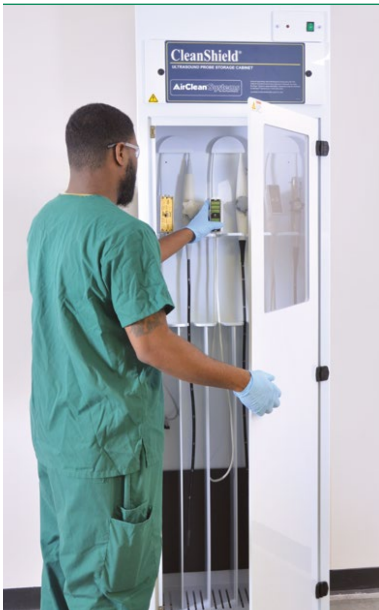
CleanShield® TEE Probe Storage Cabinets are designed to safely and securely store disinfected TEE probes.

Proper probe storage has long been an issue of debate. Until somewhat recently, there were no widely accepted practices or standards for TEE probe storage. One introduces various risks if a probe is improperly stored. As a result, some obviously impermissible choices for probe storage include pillowcases, countertops, and hanging in the open-air. Some facilities store TEE probes in the manufacturer's carrying case, however probe manufacturers explicitly state that their carrying cases are not meant for storage. The way TEE probes are stored is of vital importance for retaining their high-level disinfection status and, thus, to patient safety.