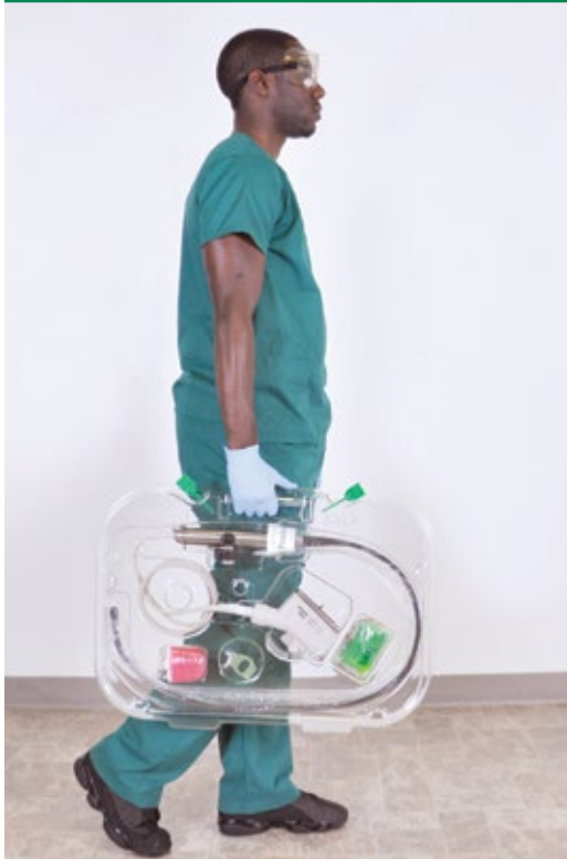
TPorter® TEE transport device

Best practices for TEE probe transportation from one area of a facility to another are not always utilized. Instead, less effective methods such as plastic bins, trash bags, and even pillow cases are sometimes used to transport these devices. Being expensive and highly sensitive, TEE probes should be handled in a much more delicate manner. Probes transported using these unsafe and ineffective methods are more likely to be damaged. In a fast-paced healthcare setting, staff could easily damage a probe by accidentally banging the distal tip against a doorframe or even dropping a bag that isn't properly secured. Just a single scrape along the shaft or a hard bump against the distal tip and a probe could be damaged or, in the worst-case scenario, broken beyond repair.