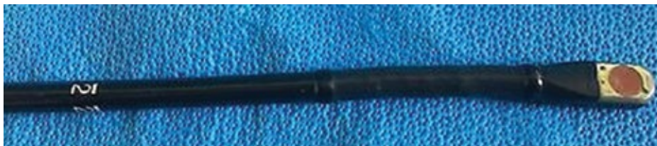
Transducer damage due to impact on the distal tip

In an effort to stretch funding, a facility may choose to purchase off-brand and alternate versions of cleaners and disinfectants, but the money saved may wind up actually costing more. If, for example, an HLD is used which has not been tested for material compatibility with a particular probe or with the reprocessor it will be used with, it may prove too weak or too strong to accomplish high-level disinfection. If the HLD does not have the correct MRC, it will result in a probe which has not actually been disinfected, leading to a health risk for patients and wasted time on the part of the facility. If the HLD is too strong, it can damage the surface of the probe's insertion tube and permanently damage the probe which will require costly repairs. Worse, if the damage is minor and goes unnoticed, it could result in a compromised insertion tube that is much harder to reprocess and could become a health hazard.